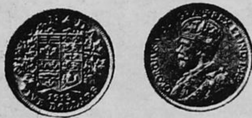
5 DOLLARS GOLD

There were about 32 of these gold coins presented at the party. One wonders how many of them are still with the original owners or his heirs..or even in the Newboro area today.