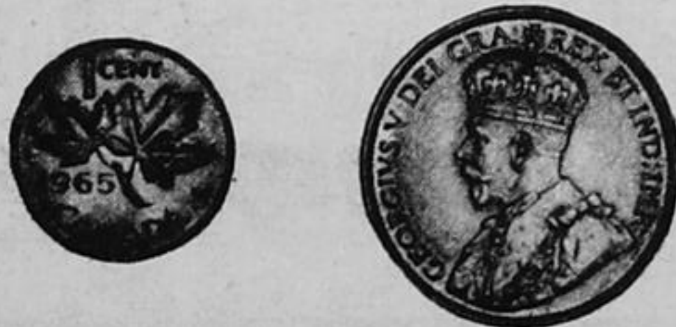
Small Cent Large Cent