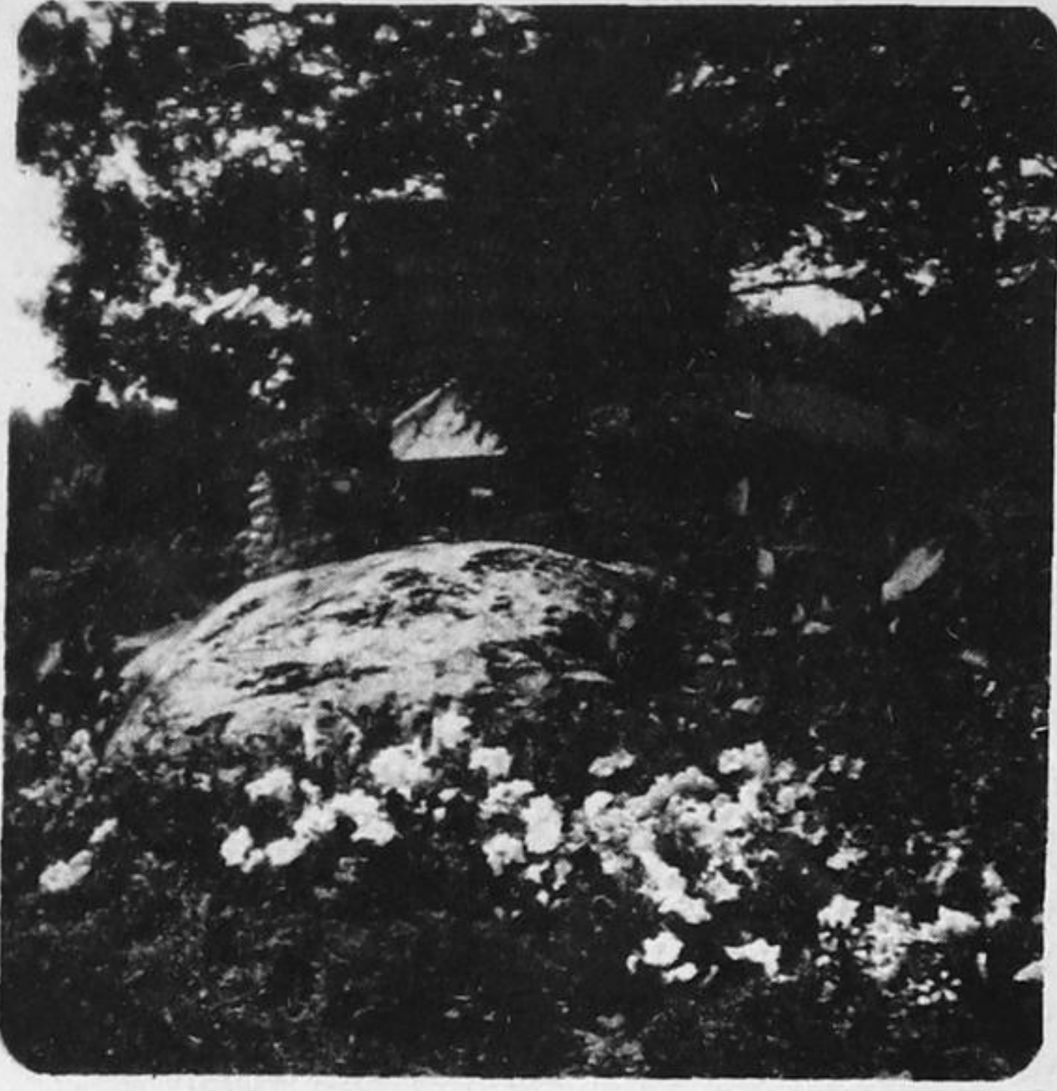
LOWER BEVERLEY LAKE TOWNSHIP PARK