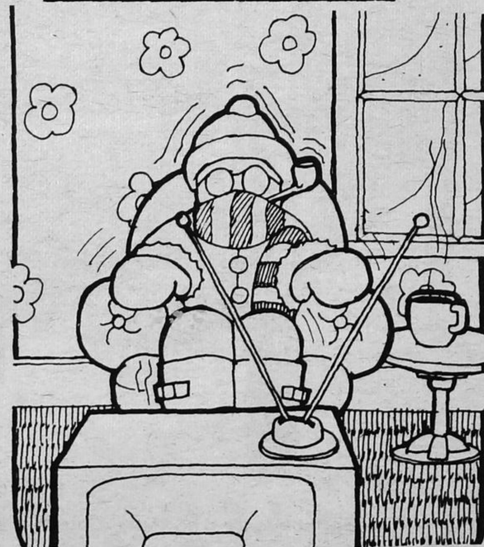
A well insulated house is a comfortable house!