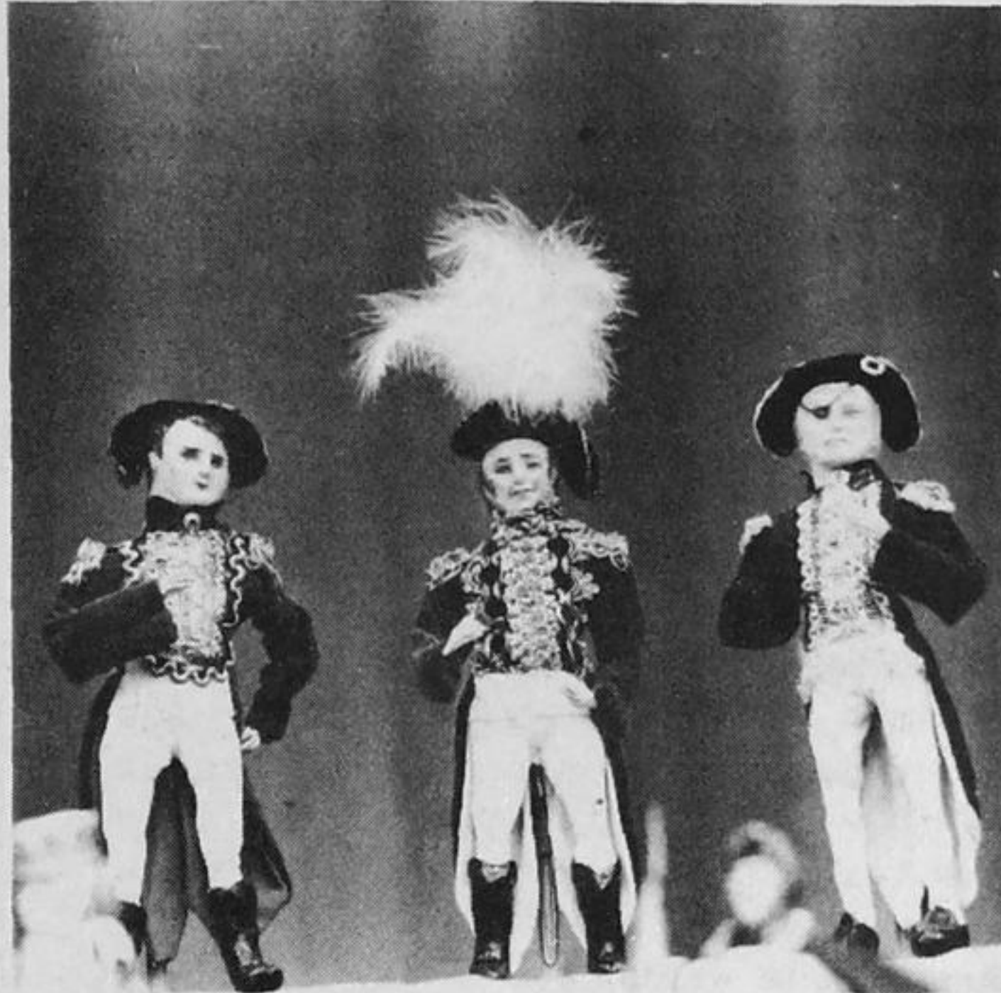
A variety of fascinating dolls were exhibited at the Antique Doll and Toy Display in Westport, Dec. 28-30.

The next meeting will be held Feb. 7 at R.D.H.S.