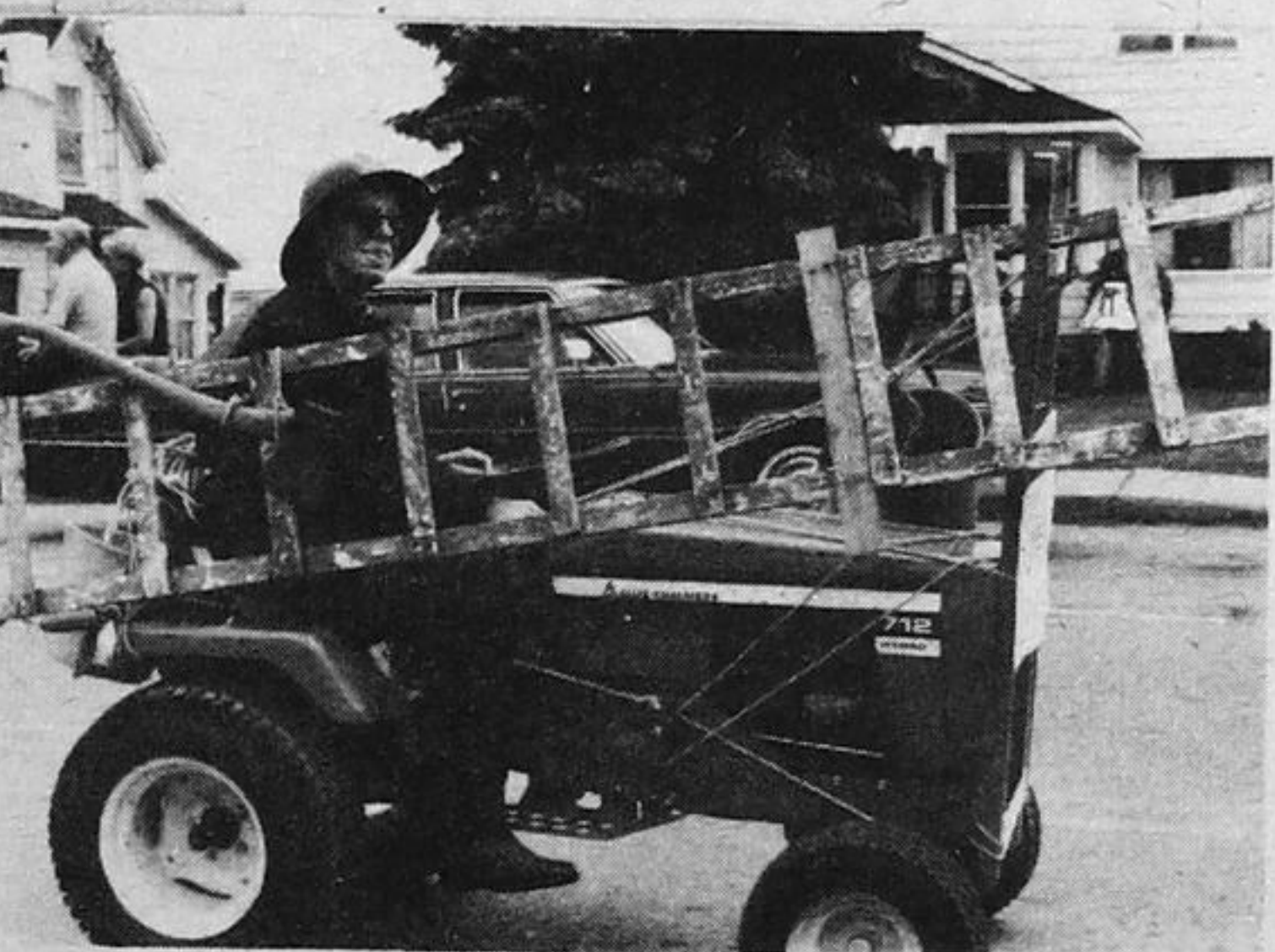
THE PARADE which kicked off 10th Anniversary celebrations for South Crosby Volunteer Fire Department in Elgin last month.