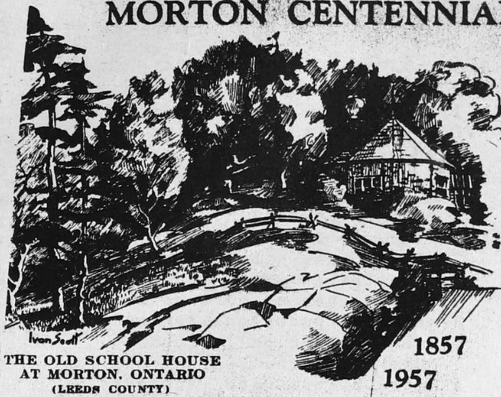
THE OLD SCHOOL HOUSE AT MORTON, ONTARIO (LEEDS COUNTY)

many short books, the one most known - THE GRANARY TO HEAVEN.