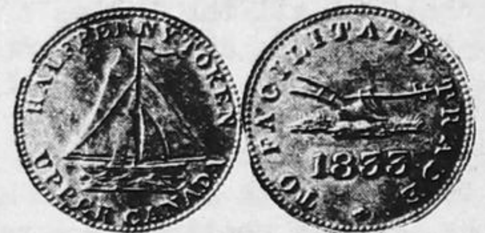
1/2 Penny Trade Token 1833