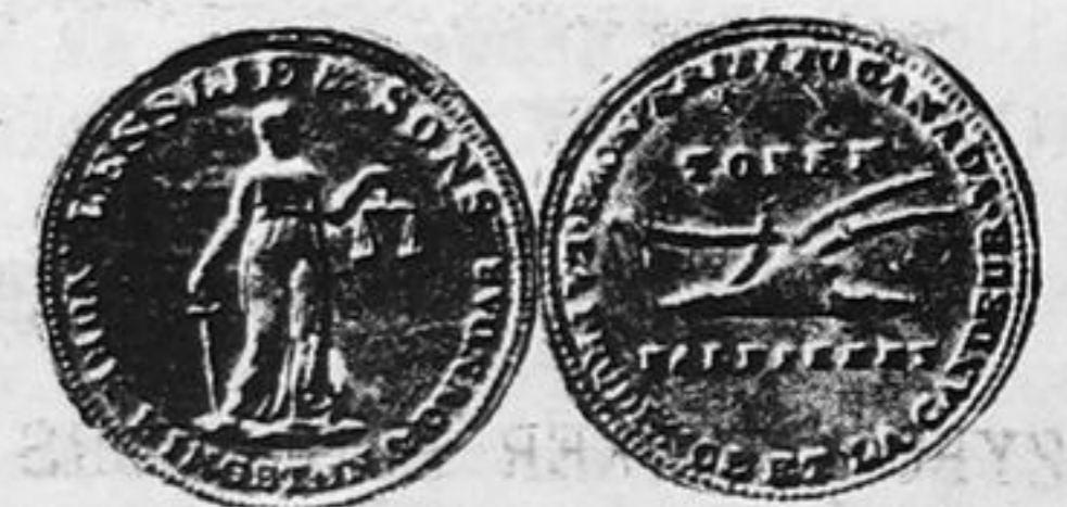
Lesslie 1/2 Penny (Toronto)