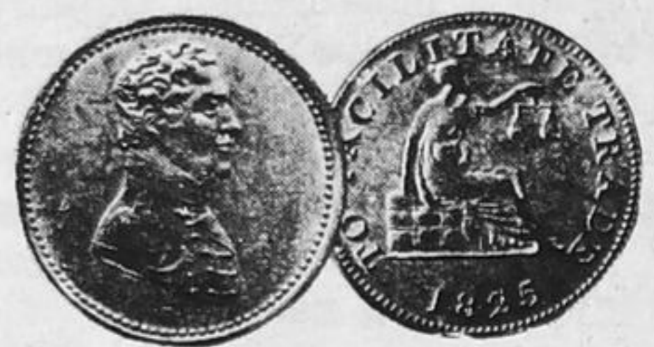
1/2 Penny Trade Token 1825

Perhaps some of these tokens are still lying around in old tobacco tins, in desk drawers or wherever souvenirs are kept. Although some are quite rare and valuable, the more common ones sell for about $2. in worn condition to $10. in nice shape. As it was not until 1858 that coins were struck for the 'Province of Canada', the tokens form a valuable part of Canadian numismatic history.