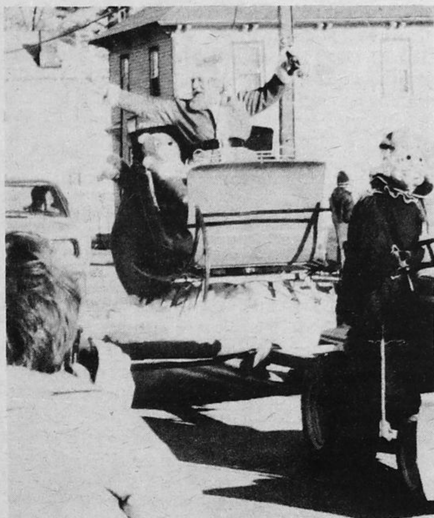
SANTA CLAUS and his moose, only a few of the many attractions at Lyndhurst's Santa Claus parade.