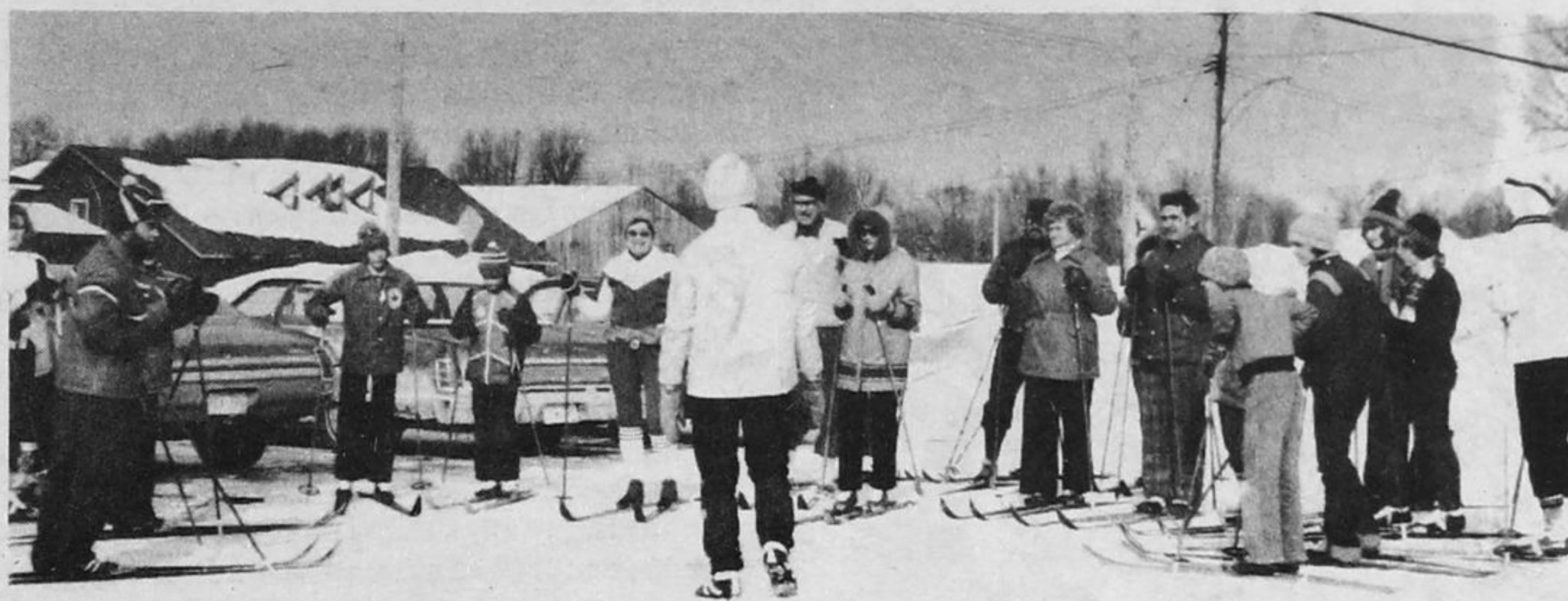
The good turn out of cross country skiers at the Portland Fun Fest shows the increasing popularity of the sport.