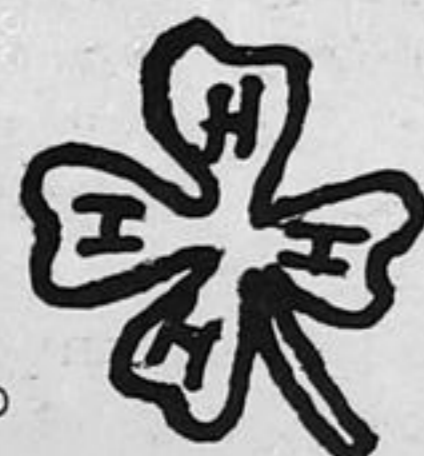
Delta 4-H Club

At the conclusion of the meeting, both the Grand Master of the Province of Ontario and the Grand Master of the State of New York gave short addresses.