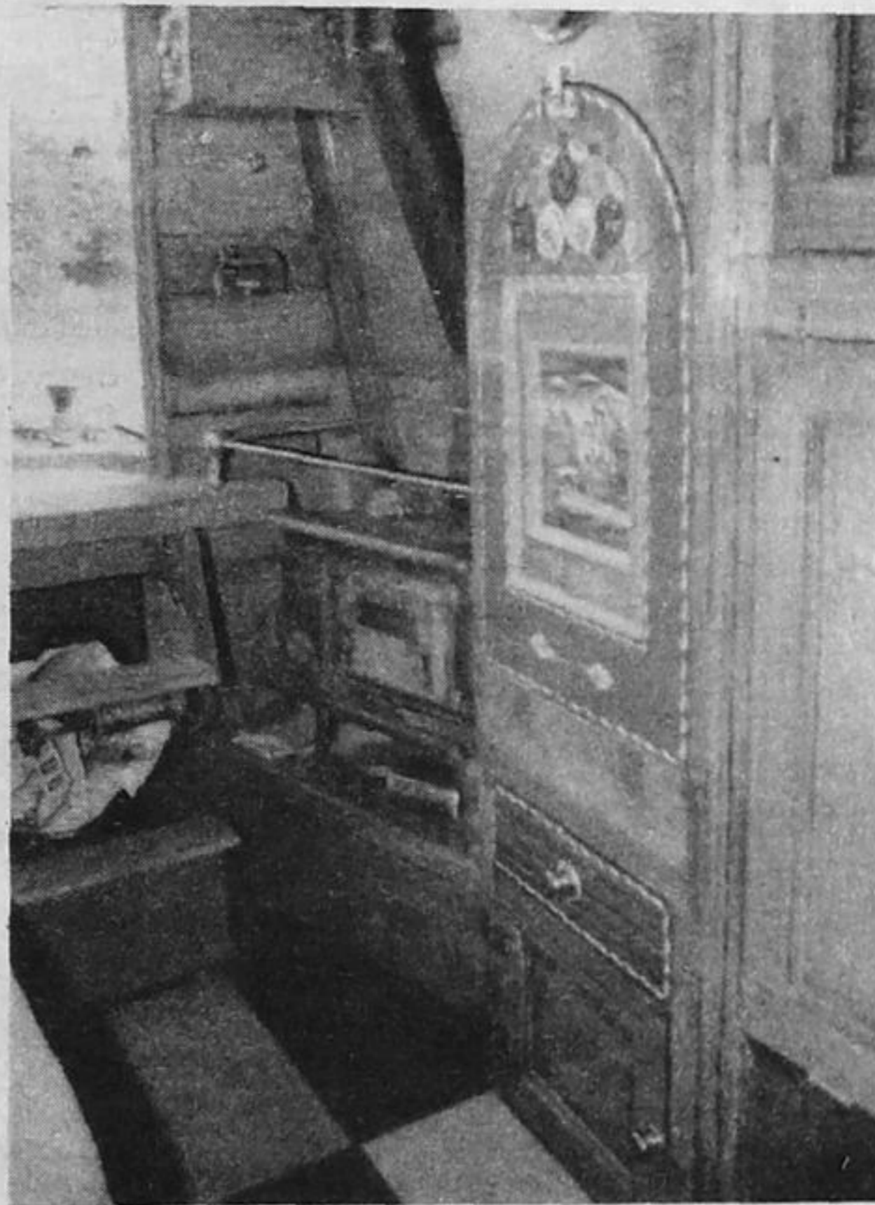
A peek inside the cabin