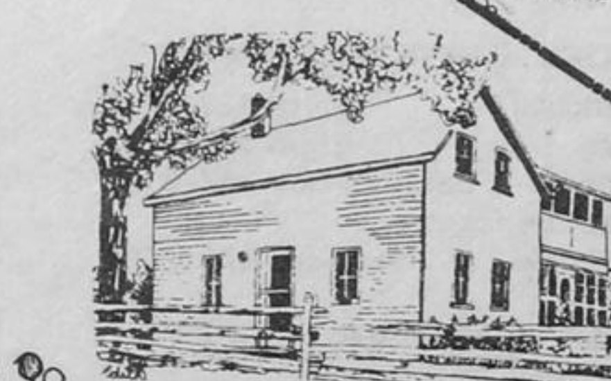
PETER SWEENEY HOUSE JONES FALLS