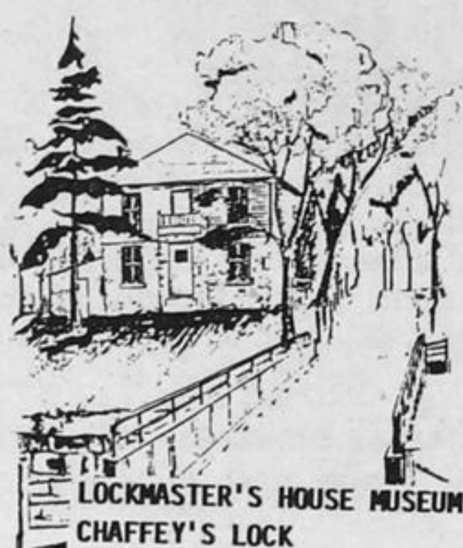
LOCKMASTER'S HOUSE MUSEUM CHAFFEY'S LOCK