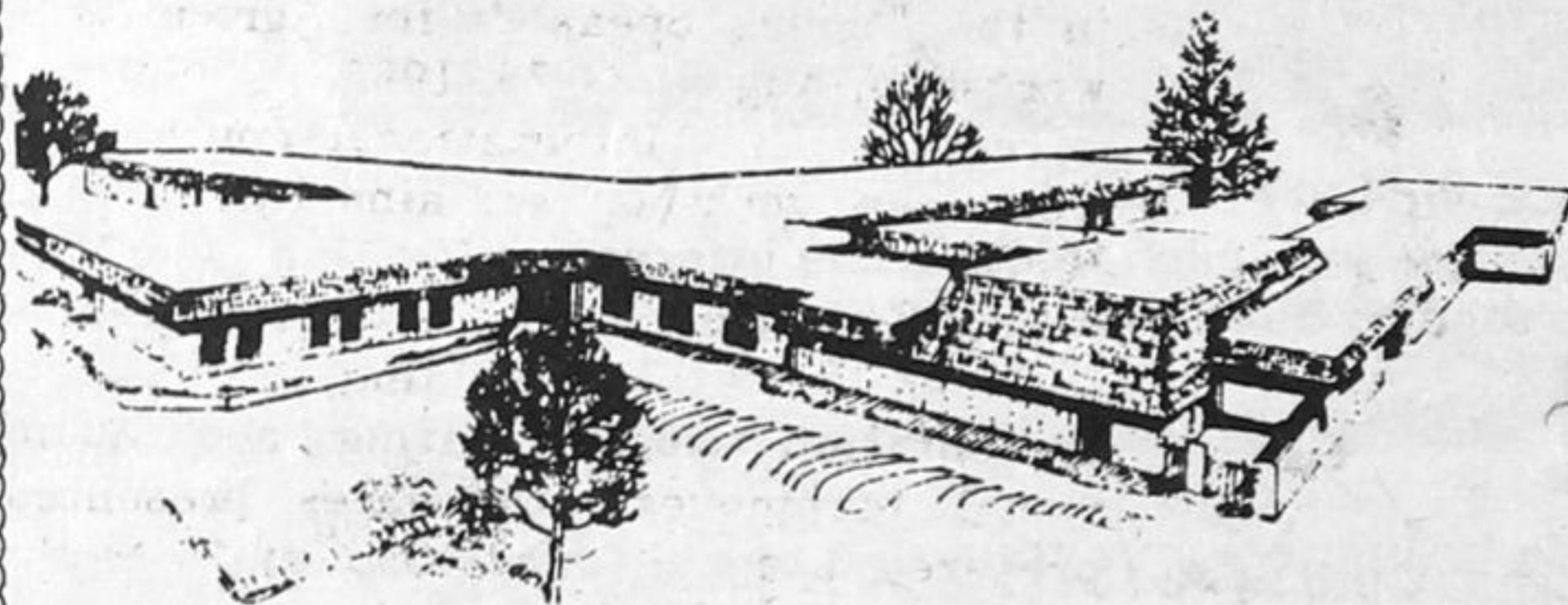
Carveth Lodge Carveth Nursing Home Ltd. 1978.

Member: Ontario Nursing Home Association