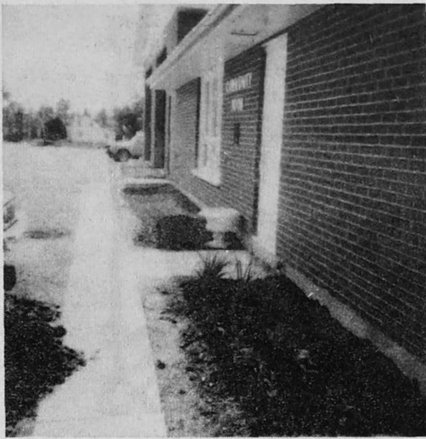
South Crosby Firehall Complex.. the "long walk" completed.