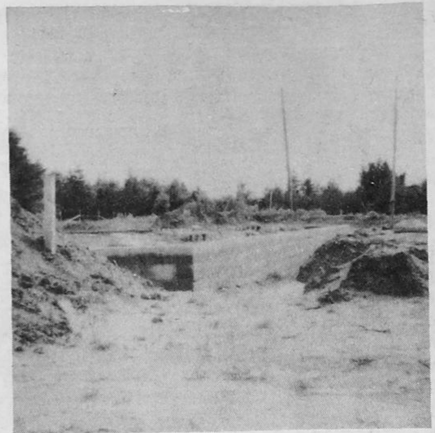
A few weeks later.... well drilled, footings poured and foundation walls finished!

The new facility will offer an alternative to all community groups for their events. It is hoped to keep the rental fee reasonable and that all groups will consider using the hall for a variety of events from dances, receptions, trade shows, etc.