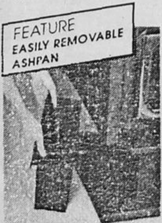
FEATURE EASILY REMOVABLE ASHPAN

We're proud to introduce the Osburn 1600, our most outstanding woodstove! It has low clearances to combustibles, an easy to use single air control with an internally-fed start-up air setting,