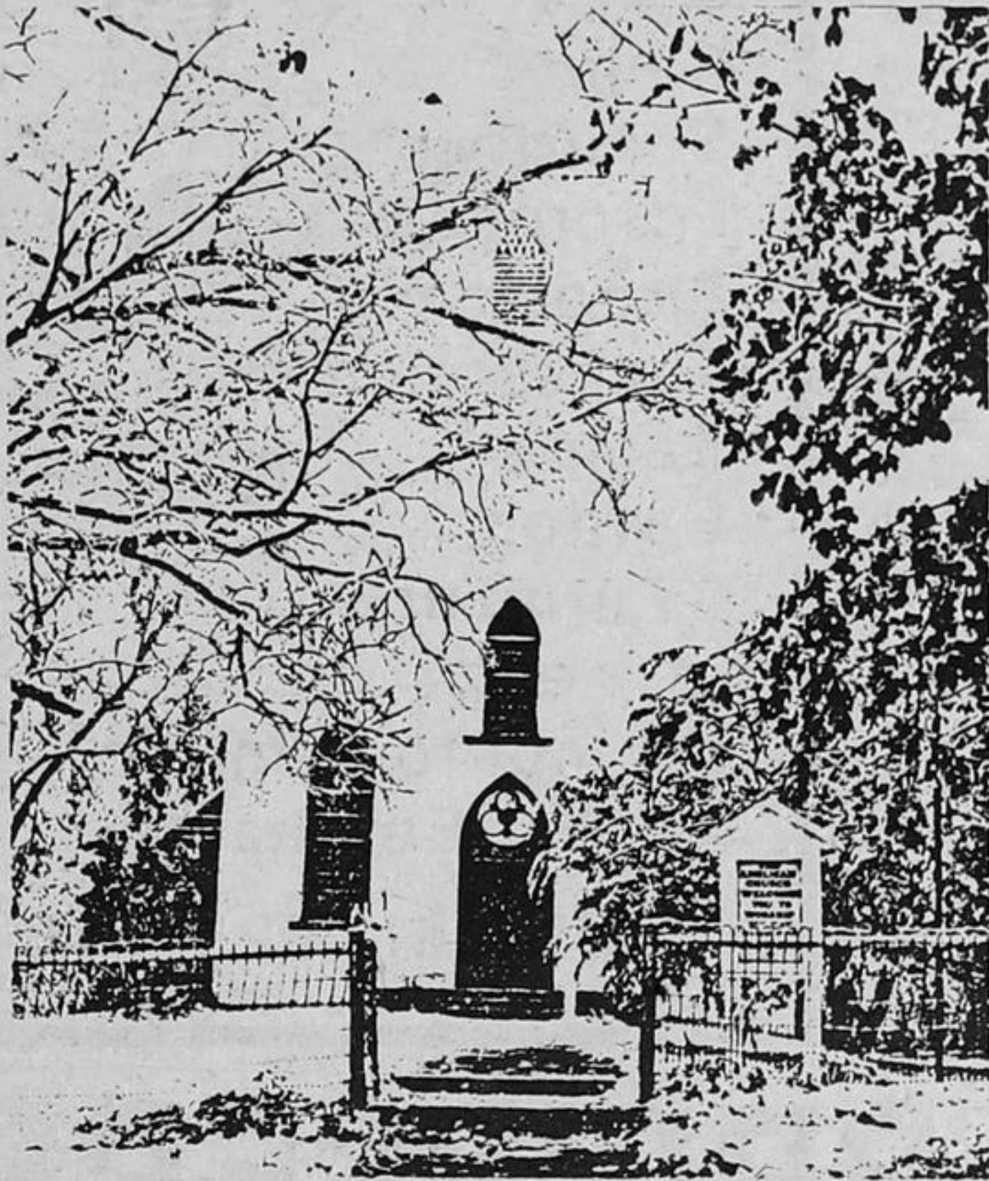
St Paul's 1811

St. Paul's Anglican Church in Delta invites you to a Community THANKSGIVING SERVICE