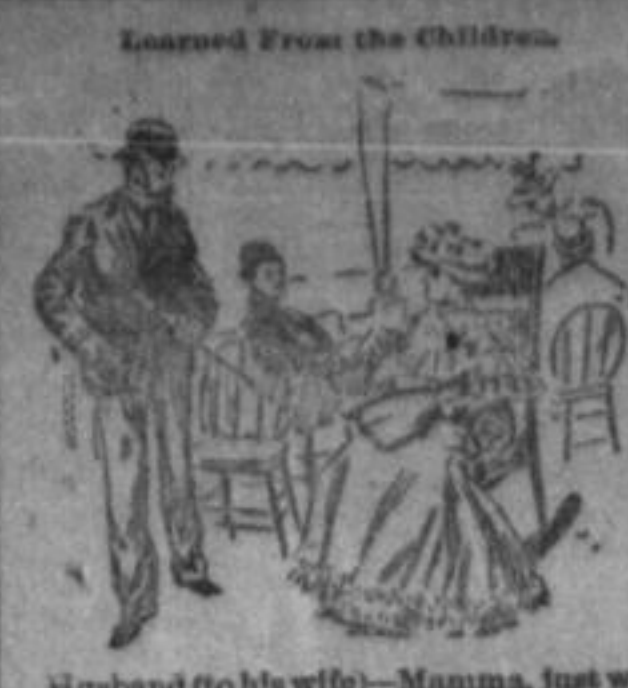
Invited to his wife—Mamma, just wait here while I run up the walk a few minutes. Bachelor (in the background)—Heavenly is it possible he is the son of that youngish looking woman?—Harper's Bazar.

Send 25 "Sunlight" Soap wrappers (envelope bearing the words "Why Does a Woman Look Old? Sooner Than Her Hair") to Lester Bros., Ltd., 43 Beatt St., Toronto, and you will receive by post a gratis perfume, free from advertising, and well worth framing. This is an easy way to beautify your home. The soap is the best in the market and it will only cost a postage to send in the wrapper, if you have the soap open write your address carefully.