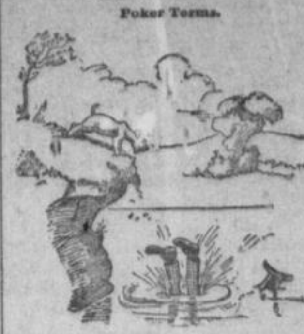
Poker Terms. "Going in." "Going out with a bang."