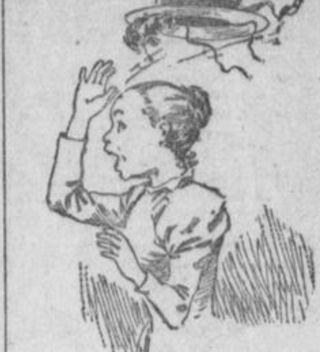
A New Use for the Cabl. Car.