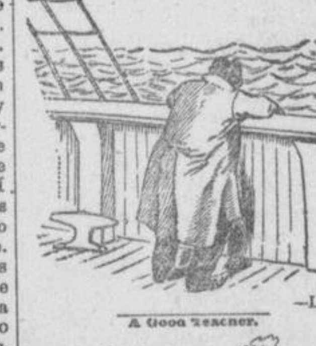
A Good Teacher.