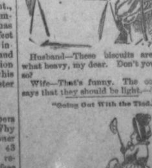
Husband—These biscuits are somewhat heavy, my dear. Don't you think so? Wife—That's funny. The cookbook says that they should be light.