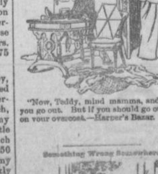
"Now, Toddy, mind mamma, and don't you go out. But if you should go out, put on your overcoat."—Harper's Bazar.