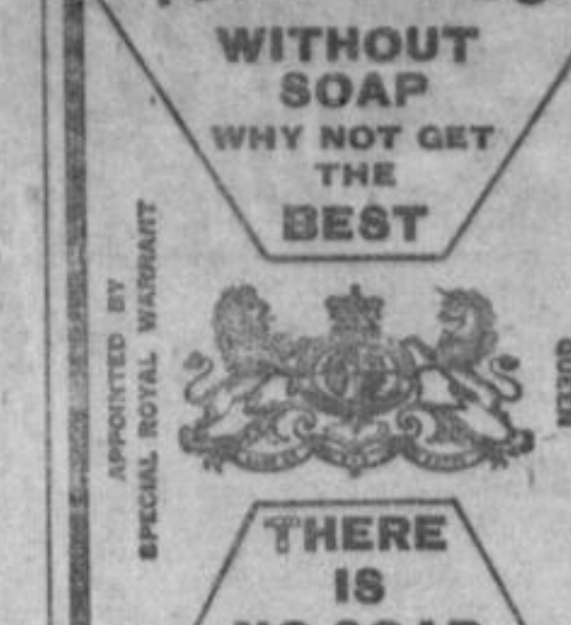
YOU CAN'T DO WITHOUT SOAP WHY NOT GET THE BEST