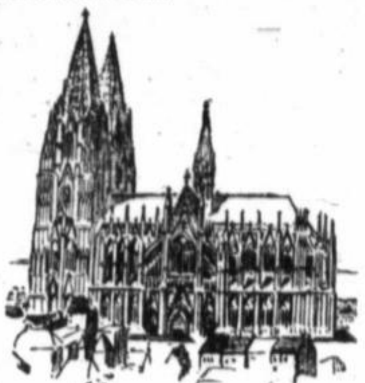
THE CATHEDRAL OF COLOGNE.

The leading object of interest to visitors in the city of Cologne, situated, as many of our young readers doubtless know, on the left bank of the romantic river Rhine, is its cathedral, which is the grandest gothic church in the world.