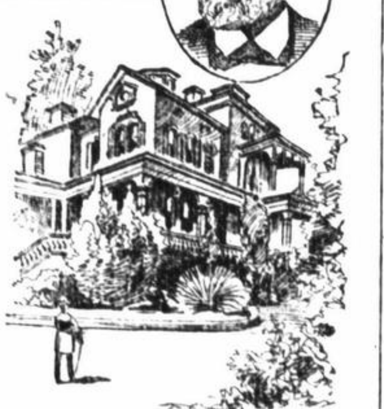
SENATOR STANFORD AND HIS COUNTRY RESIDENCE.

Stanford lives magnificently in Washington during the winter. He has several splendid teams of carriage horses in his stables at the capital. He can handle the ribbons with great skill, and in his younger days was a fine horse-back rider. But he has grown rather too heavy for this exercise now. He is a fine looking man, with a rosy face, brown hair and a gray beard. He talks slowly and deliberately, and is one of the most charitable of the millionaires.