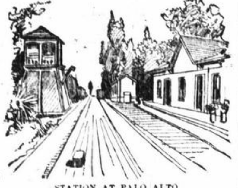
STATION AT PALO ALTO.