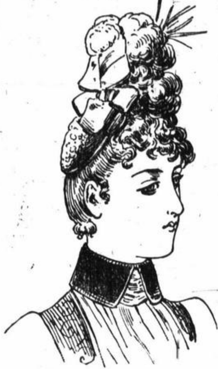
A PARISIAN SPRING BONNET.