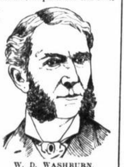
W. D. WASHBURN.

He is One of Minnesota's Pioneers, and Has Served in Congress Before. W. D. Washburn, lately elected senator from Minnesota, is a New England man, having been born in Androscooggin county, Me., fifty-eight years ago.