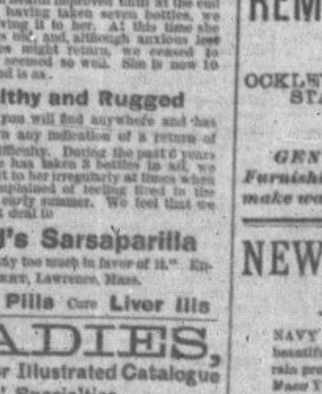
Healthy and Rugged.