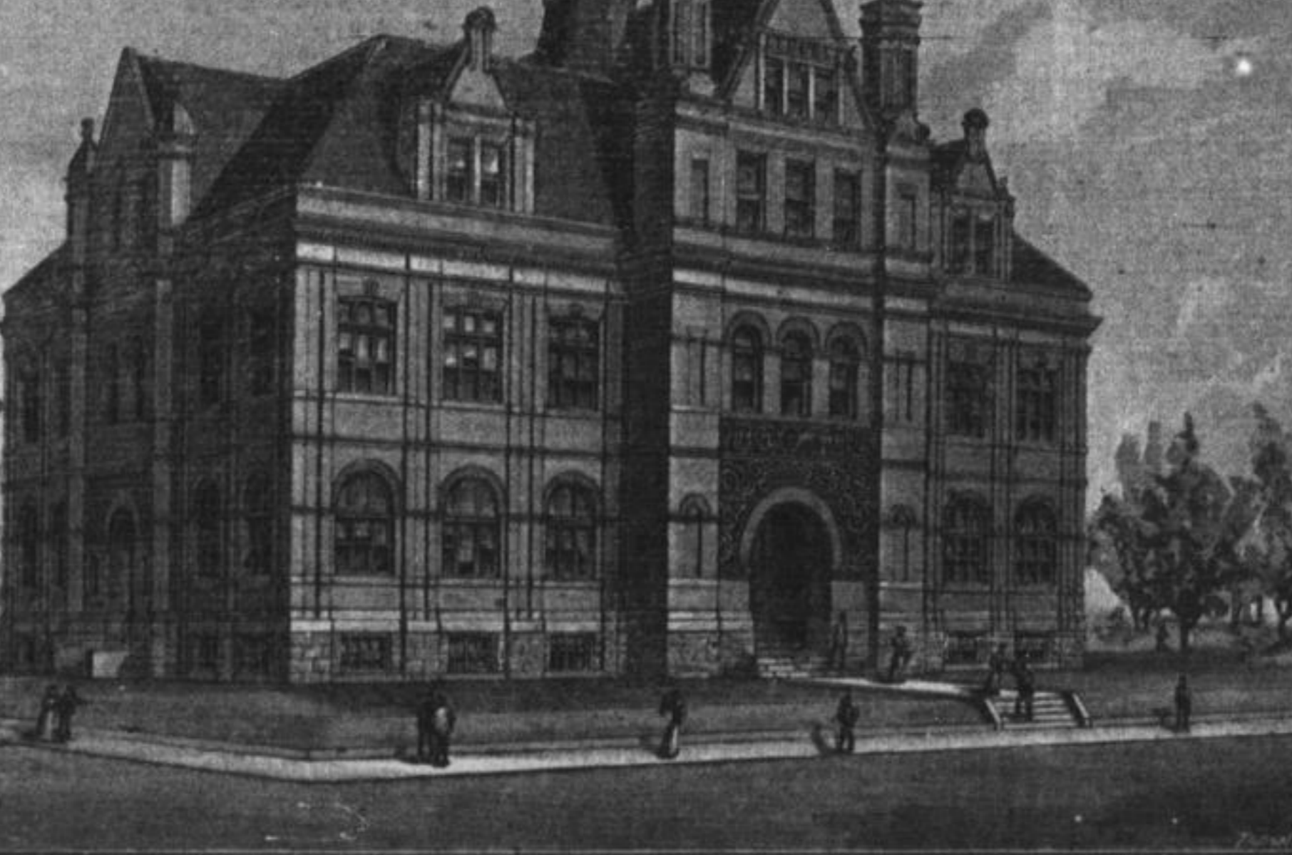
NEW COLLEGIATE INSTITUTE, KINGSTON.

TRAVELLING. THE OLD RELIABLE CUNARD LINE. Established 1840. Oldest Line in Existence.