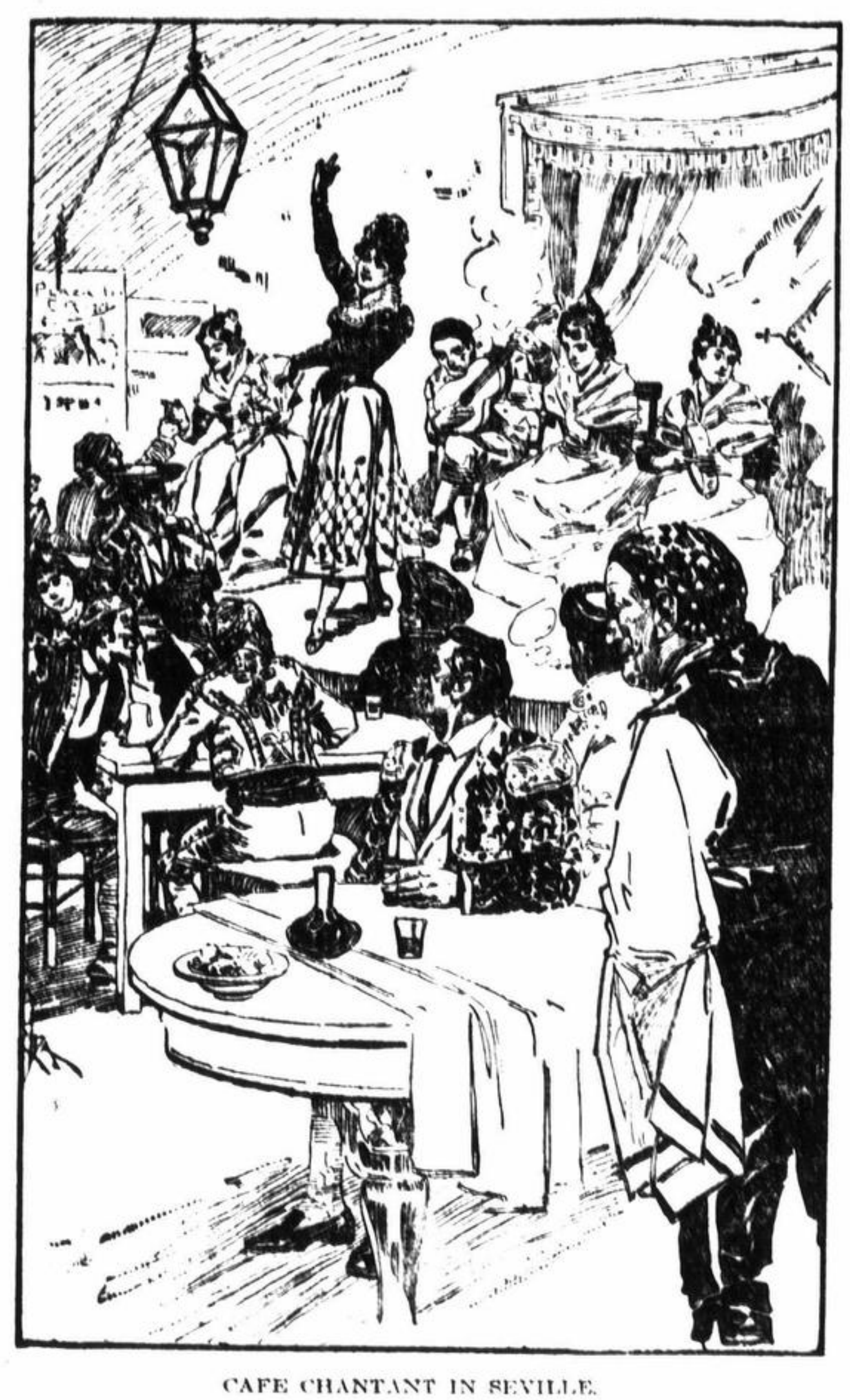
CAFE CHANTANT IN SEVILLE.

Public Opinion Molded by Gay Senioritas.