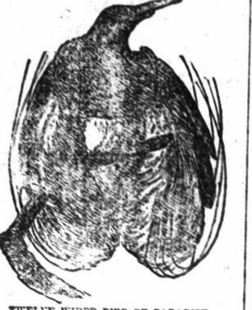
TWELVE WIRED BIRD OF PARADISE.