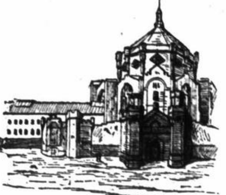
EXTERIOR OF THE PRISON.

Belgium has carried the system of solitary confinement to its farthest possible limits. Her scientists and administrators have apparently studied long on plans to preserve a prisoner in health and sanity, yet completely isolated from his fellow beings, and the result is seen in the cellular prisons, of which Belgium now has thirty.