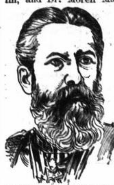
CROWN PRINCE FREDERICK WILLIAM.

Dire rumors have reached this country in regard to the cancerous growth in the throat of Frederick William, crown prince of the German empire and of Prussia. These rumors have been so conflicting in statement that it is hard to get at the truth.