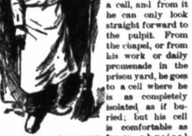
PRISONER IN WORKING FAR as physical DRESS.