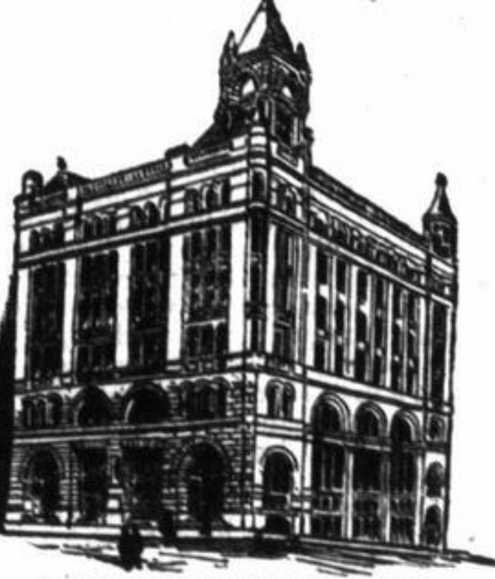
THE NEW EXCHANGE BUILDING. soon justify the existence and insure the continued activity of both.

The rapid growth of New York city's business has created a new organization known as the Consolidated Stock and Petroleum exchange, which is erecting a magnificent structure at the corner of Exchange place and Broadway.