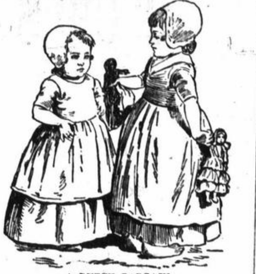
A DUTCH BARGAIN.

The picture here presented to our young folks is from Harper's Young People, and is worthy of more than a passing glance. In the first place, it proves that human nature is pretty much the same the world over, and that little Dutch girls living away off in that flat country called Holland are not all of them exempt from selfishness, any more than are the young girls in America.