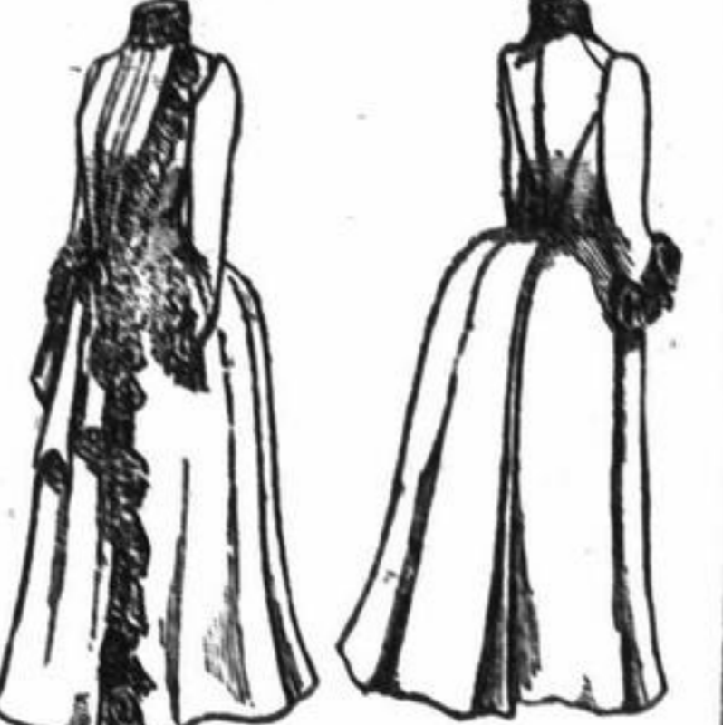
A COMFORTABLE HOUSE DRESS.

A house dress that is simple enough to be thoroughly comfortable, and yet not too negligee, is a necessity in every lady's wardrobe, and is never more thoroughly appreciated than during the spring and summer months, when a perfectly close fitting dress is often irksome. The princess shape is susceptible of so many modifications and its possibilities in the way of graceful garniture are so great that it is more often the choice than any other style.