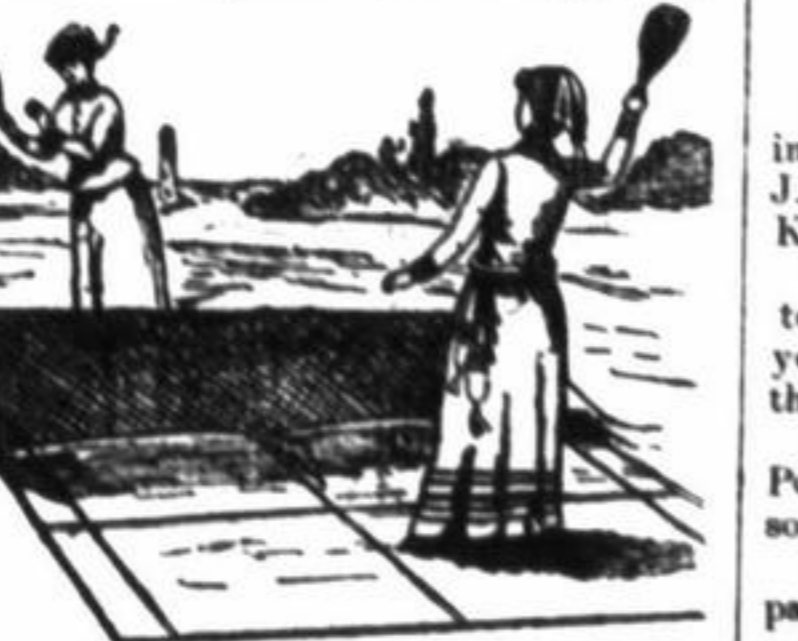
THE TUXEDO SUIT.

Numbered with new costumes entirely original in design and very attractive in appearance is the Tuxedo suit, introduced this spring and especially adapted for out door exercises. The Tuxedo is a regularly knitted costume, in which are employed the finest of worsted materials, showing contrasting colors.