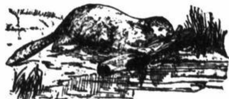
THE BUSY BEAVER.

Nothing is wasted by the industrious beaver. He strips the bark from the branches of trees, with which he builds the walls of his castle and stores it away for food in winter. The branches which the beaver carries in his fore feet—that become arms when he works—are laced together with twigs and the spaces plastered with mud. The roof is formed of branches and moss massed together with mud. But how does the beaver accomplish all this carpentry and masonry? Some readers may not know. The answer is, with nature's tools.