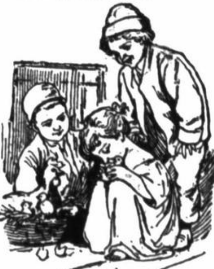
THE COUNTRY CHICK.

With many a flirt and flutter Adown the mountainous snow We cautiously slid and scrambled To the huge barn floor below, Where a rooster neighed in his cozy stall, And Bossey, with big brown eyes, Looked at us over the stable bars, Munching in mute surprise.