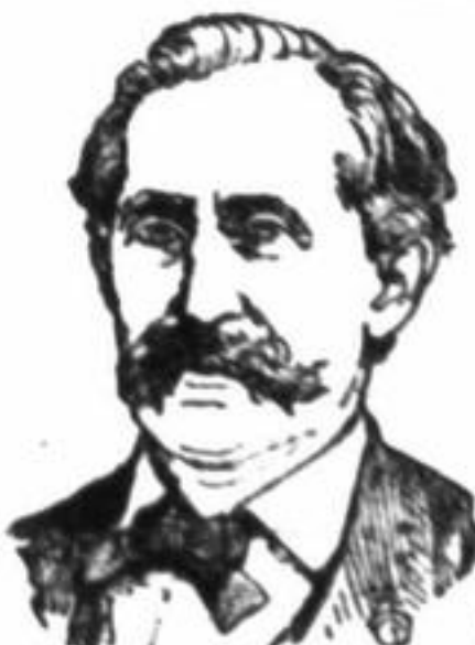
WILLIAM B. BATE.

On three occasions has ex-Governor Bate contested for the privilege of representing Tennessee in the United States senate, and success has crowned his pertinacity at last.