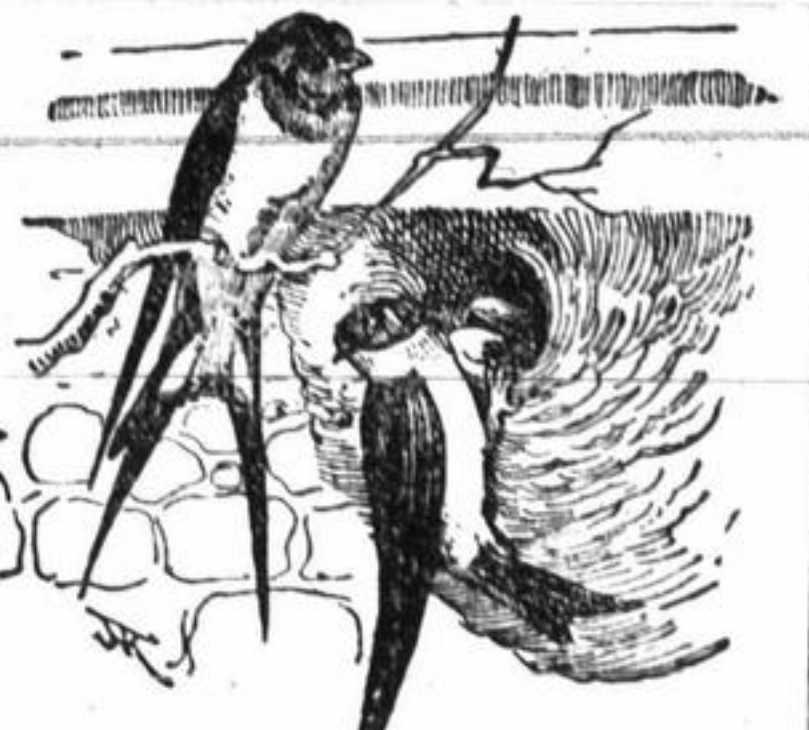
THE LEAVES SWALLOW.

None of our native birds seem more domestic in their nature and to confide more readily in their friendship of man, than does the swallow.