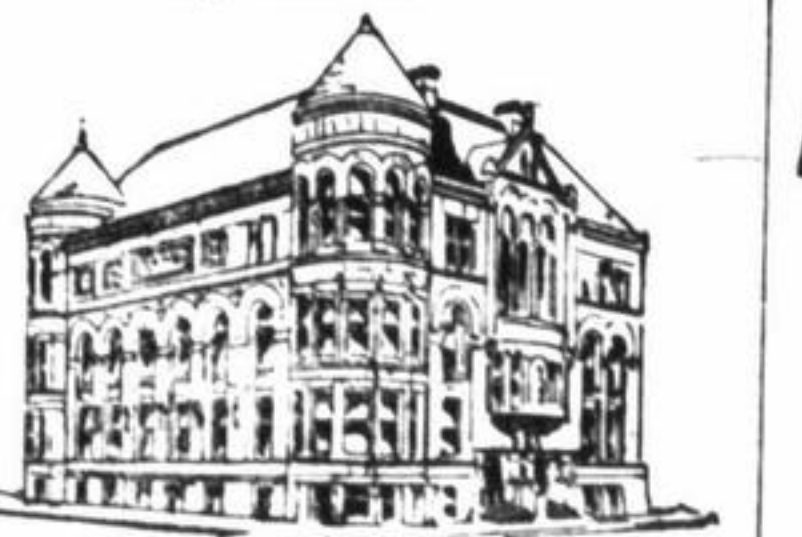
ATHENAEUM LIBRARY, MINNEAPOLIS.

The Athenaeum now possesses more than 14,000 volumes, which will be turned over to the general library, their ownership, however, being retained by the association.