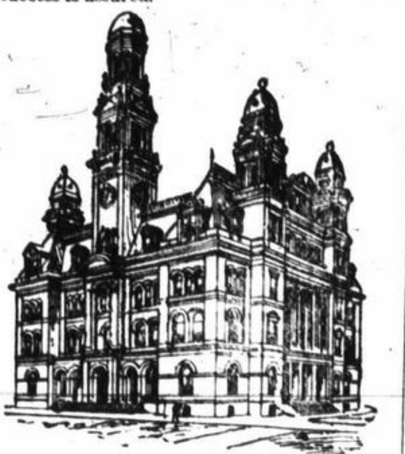
NEW POSTOFFICE, MINNEAPOLIS.

MINNEAPOLIS, Jan. 17.—Twenty-five years ago the idea of a library was broached by the members of the Athenaeum, a private association of this city.