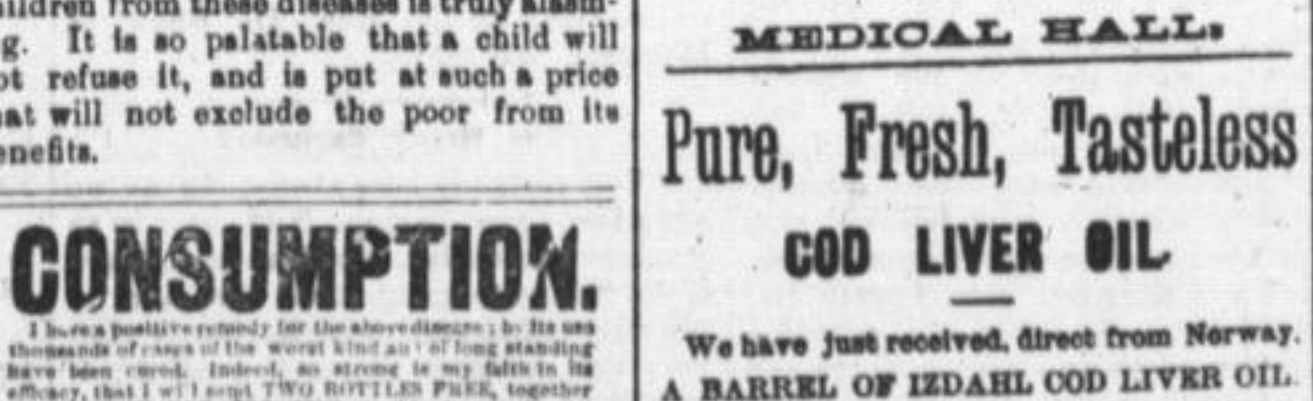
THE PRINCIPLE OF TREATMENT. THROAT AND LUNG SURGEON.