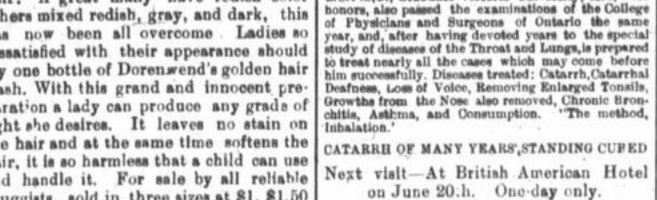
THE PRINCIPLE OF TREATMENT. THROAT AND LUNG SURGEON.