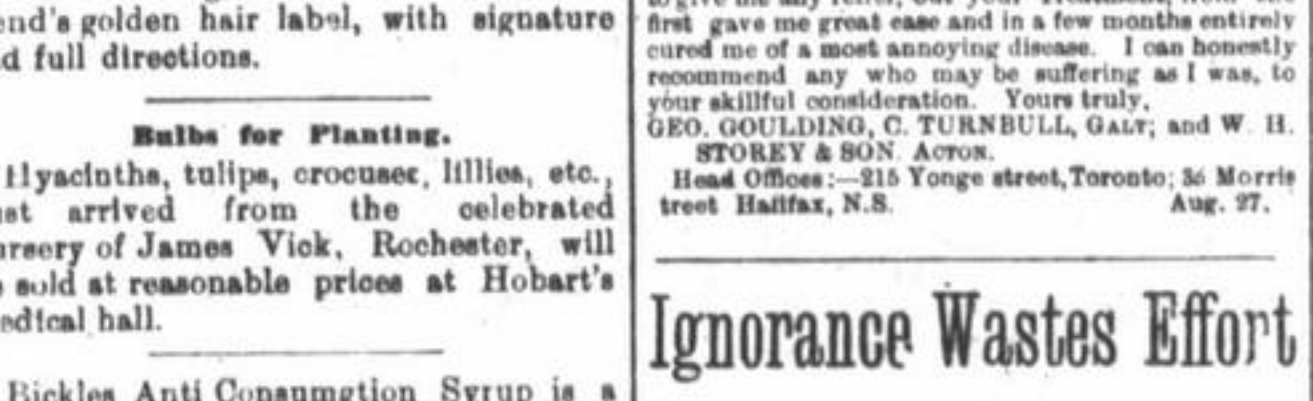
THE PRINCIPLE OF TREATMENT. THROAT AND LUNG SURGEON.