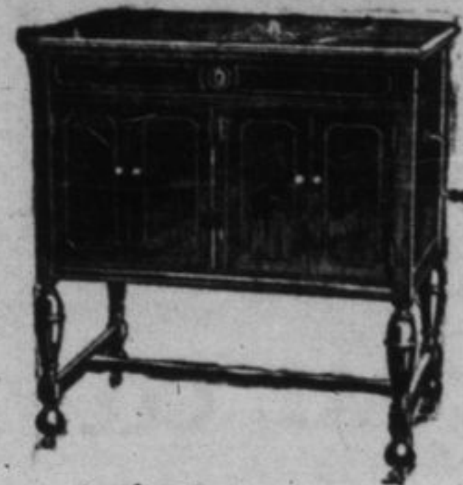
The Abbey Style 70 Mahogany Walnut or Oak Price $175.00

The high sweet notes of the violin—the low rolling bass of the organ