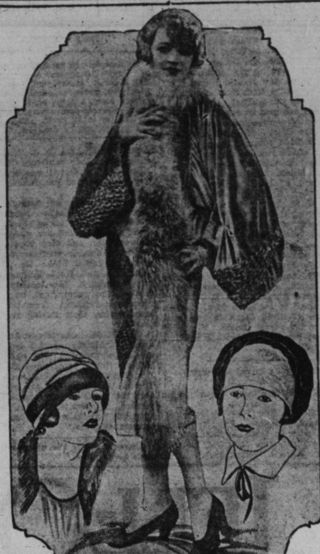
An apricot-colored velvet evening coat, the neckband panel of gray fox and the sleeves embroidered with strass. Lower left is a two-toned brown felt hat, and right is one of the new velvet models.

Acts like a flash—A single sip proves it