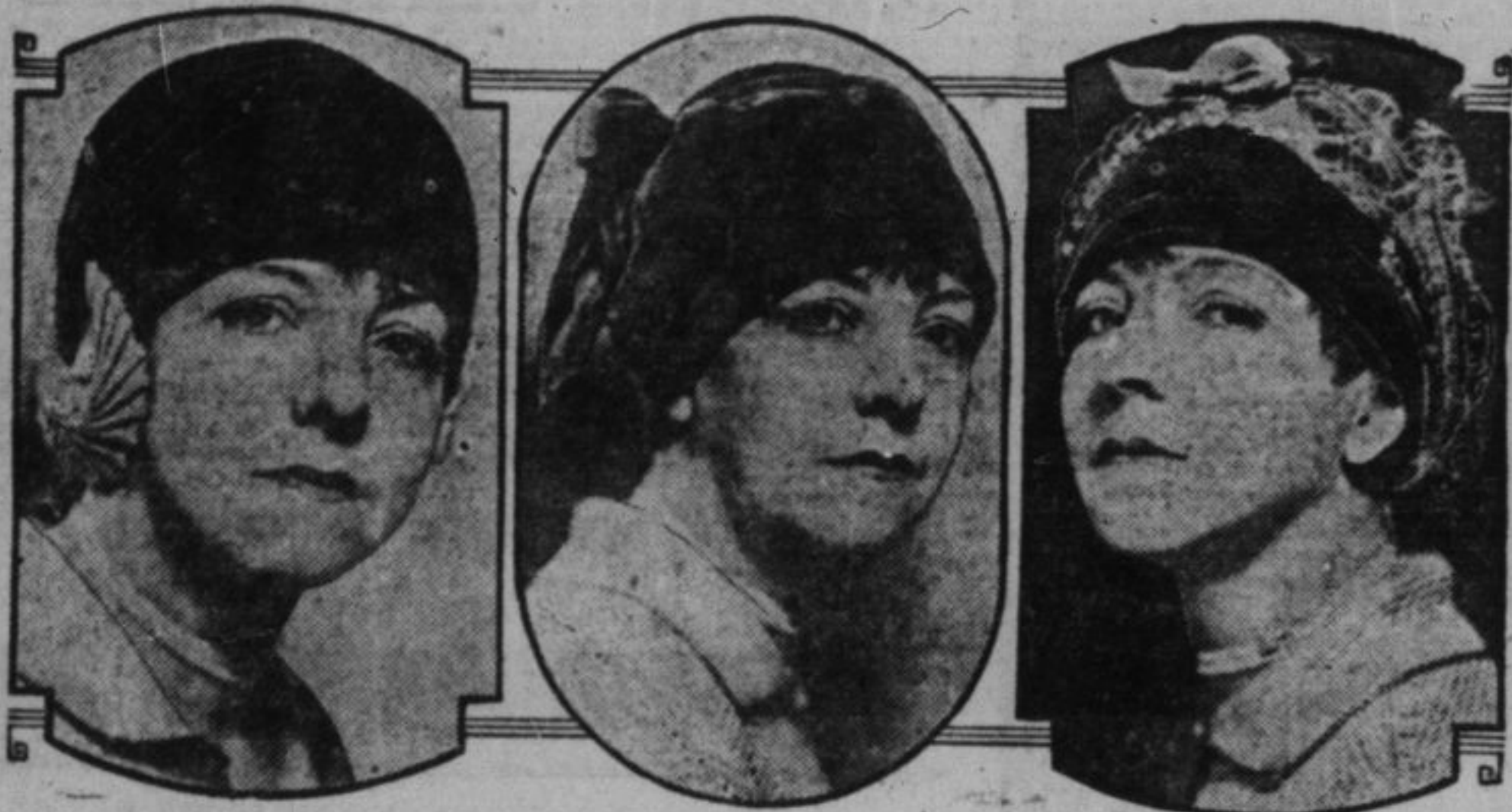
Three of the many new turban variations: Left to right, black velvet with Chinese note, bottle green velvet with fascinating high lights, and chic Rebox medal, reminiscent of the beret.