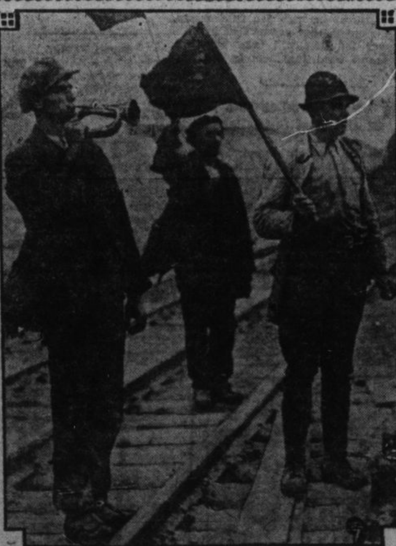
ALONG IRELAND'S RIVER SHANNON Bugles and red flags warning of imminent blasts along the River Shannon. The bugler is evidently a son of Erin, and the flagman in the background as patently as German.