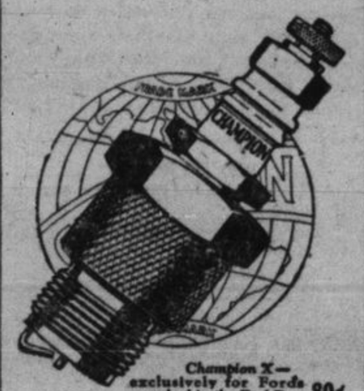
Champion X—exclusively for Fords—packed in the Red Box 60¢ Champion— for cars other than Fords—packed in the Blue Box 90¢

CHAMPION Dependable for Every Engine A Canadian-made Product Windsor, Ont.