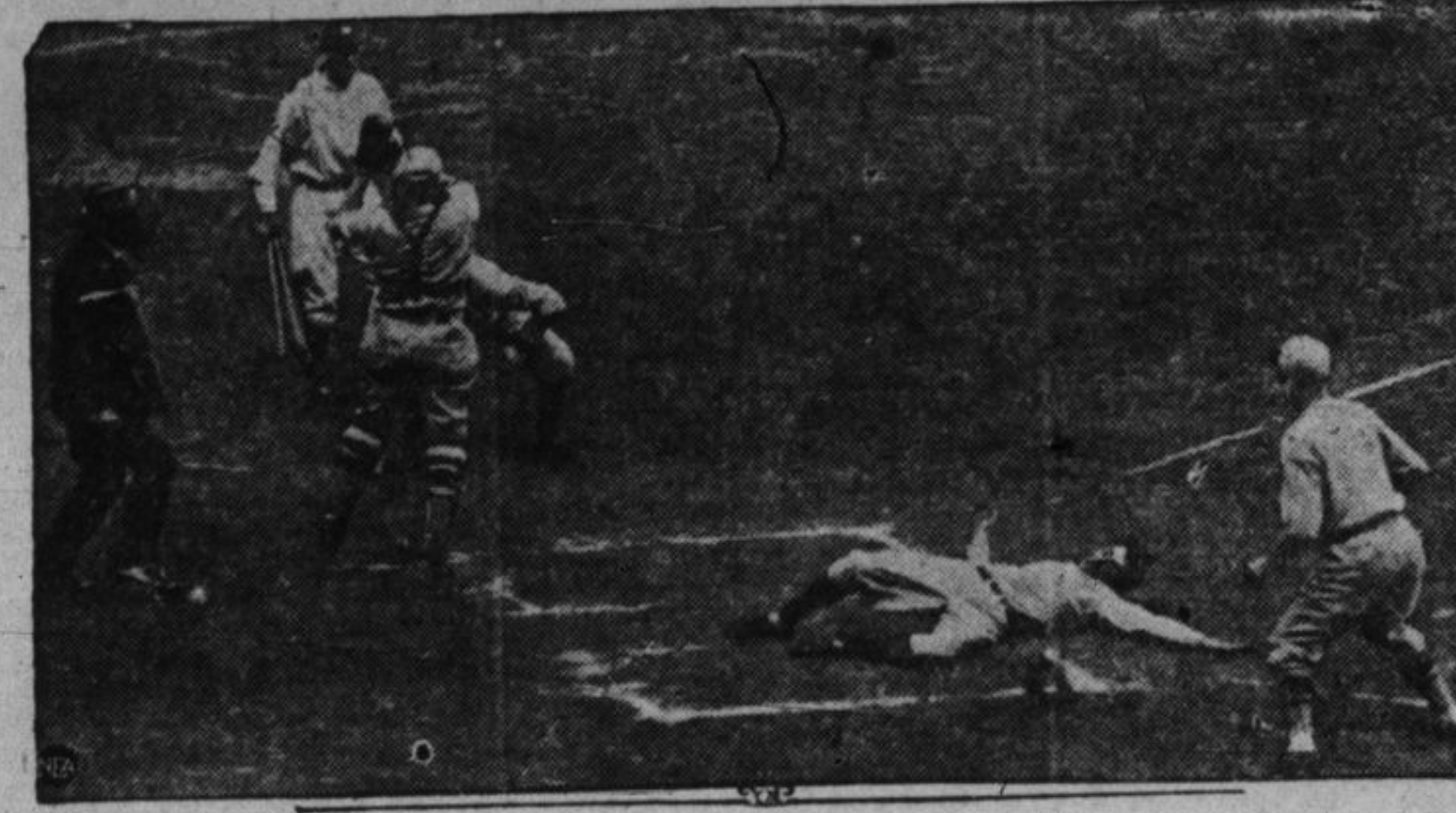
Upper: Tony Lazzeri, Yankee second baseman, was caught napping off third by a toss from Pitcher Alexander and forced into the home stretch. Lester Bell, Cardinal third baseman, and Alexander are playing catch over Tony's head in an attempt to catch the elusive runner. The ball is shown in the air.