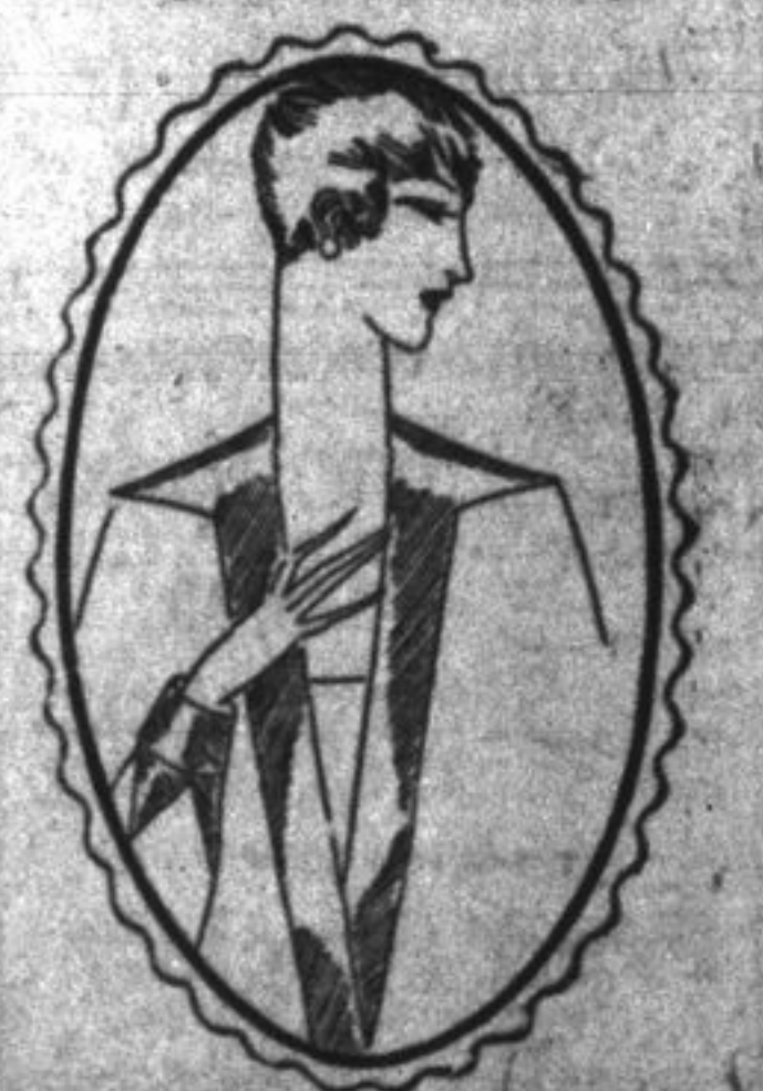
The poke and cuffs of metal ribbons furnish an interesting detail for the fall dress.