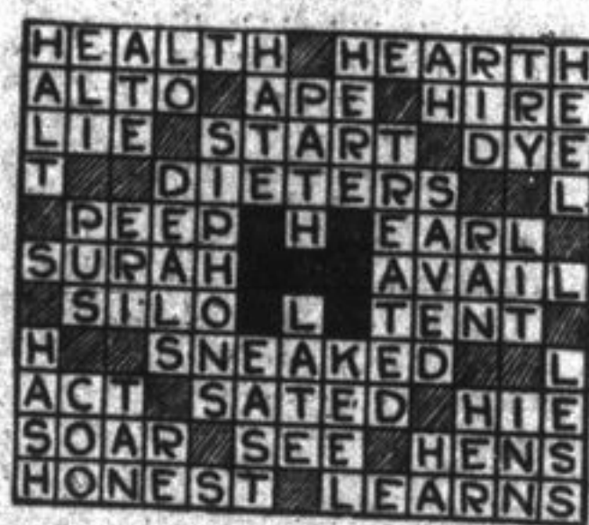
Crossword Puzzle Answer.

Air, like water or any other fluid, will flow from a region of higher pressure to one of lower pressure.