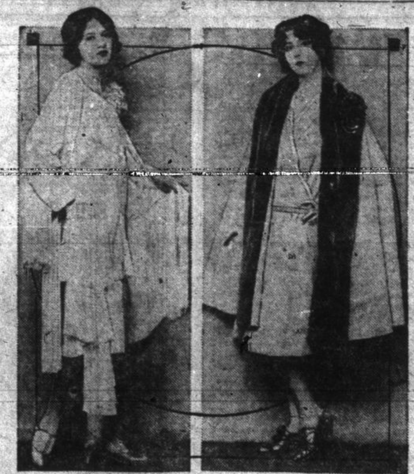
The evening frock (left) has its own wrap, which may be retained as a part of the costume or removed with the outer wrap. At the right is a street model with simple frock and cape of tan kasha cloth. The cape is trimmed in nutria fur.