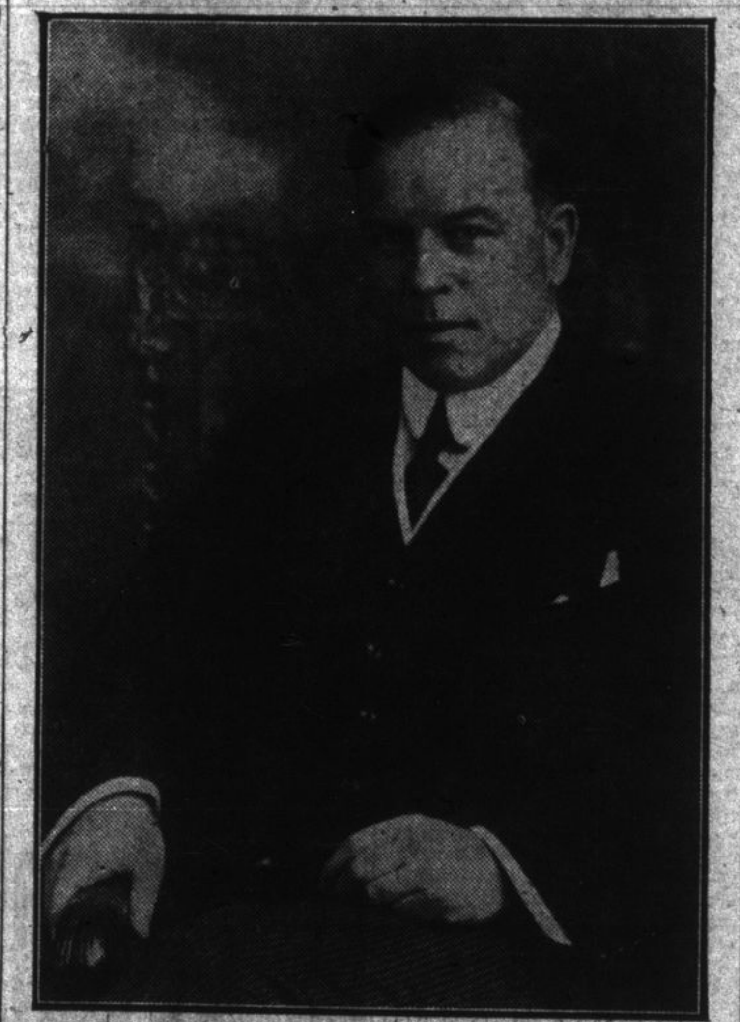
THE RIGHT HON. W. L. MACKENZIE KING, Who will be Canada's next Premier, the Liberal Party having been successful at the polls on Tuesday.