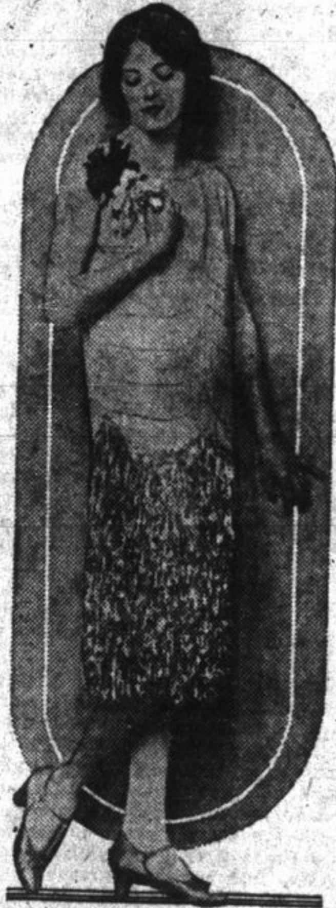
Dance frock of silver crepe and lame fringes over black net.