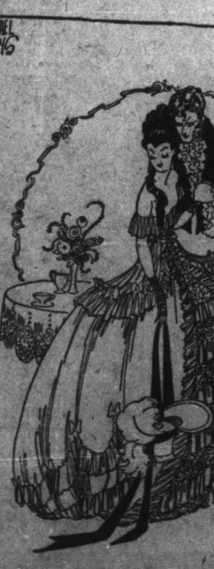
AN OLD-FASHIONED MATCH