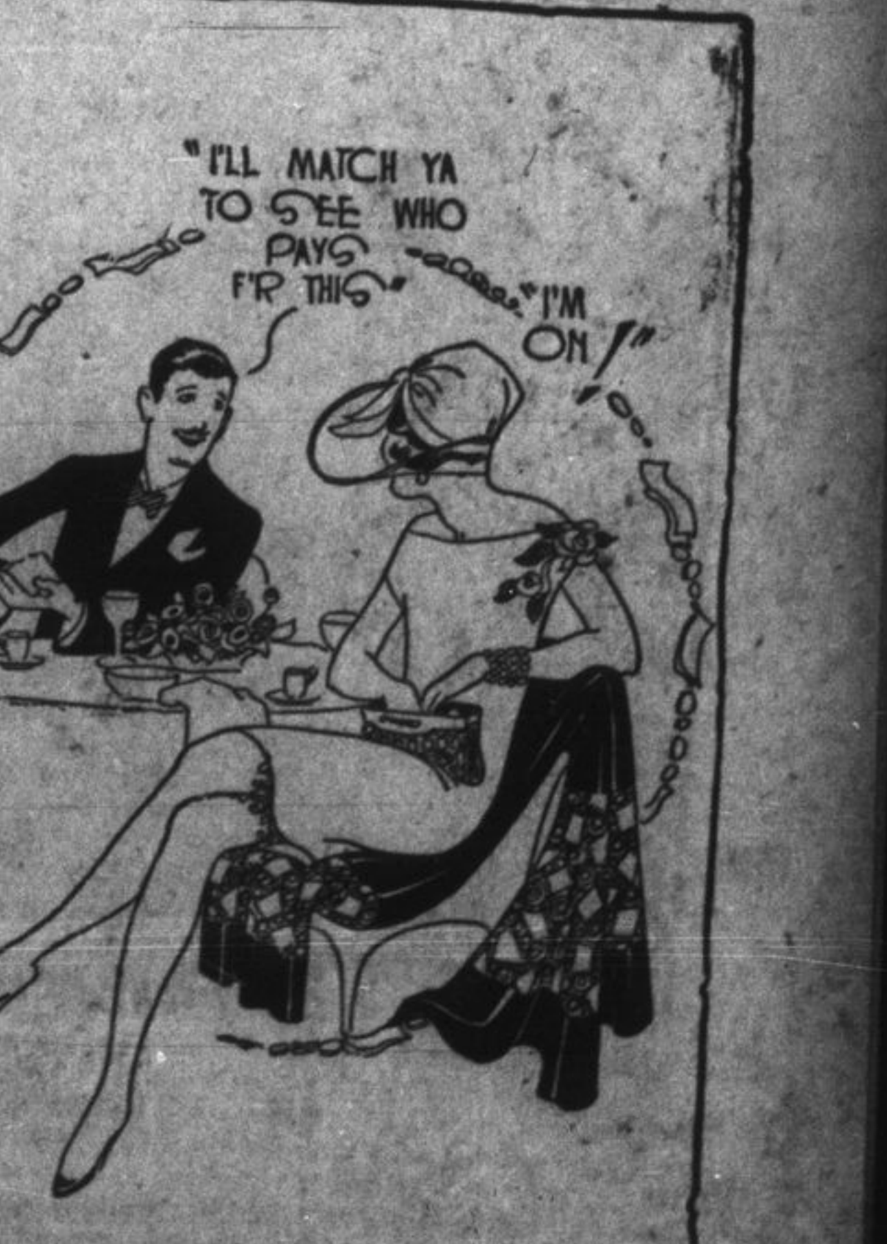
AND AN UP-TO-DATE ONE