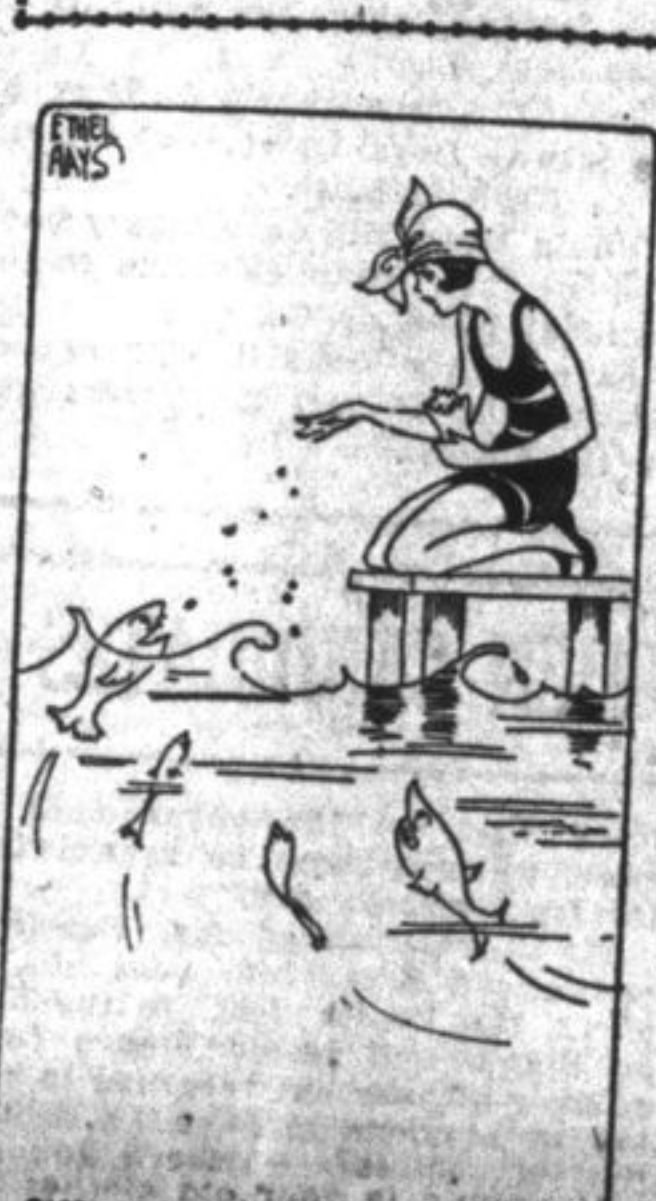
A shark is a big fish. So are men who think they are sharks.