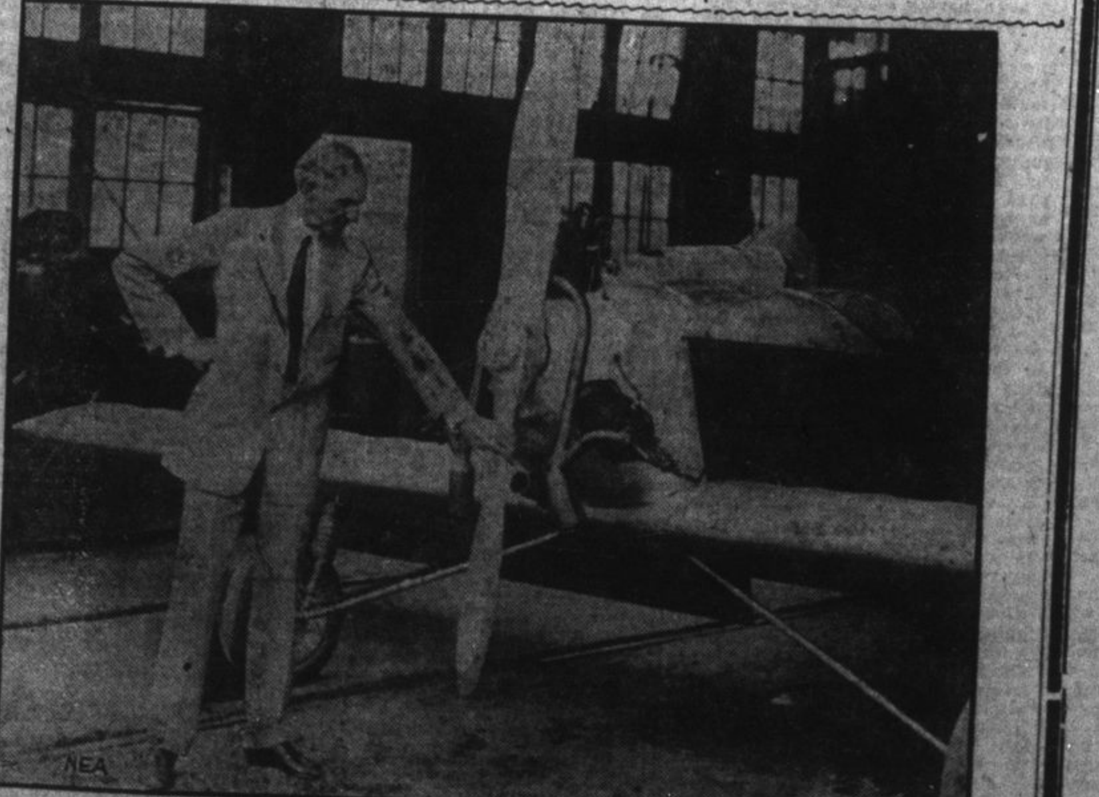
WILL HE FLOOD THE SKY WITH "AIR FLIVERS"? This shows Henry Ford displaying an experimental model of the new "air flivver" that Otto Kaplan, a young Detroit inventor, has developed in Ford's private machine shop. Ford believes that there is a big market for planes of this type, and it is hinted that his factory wing tip, is twelve feet long, weighs 320 pounds and can develop a 100-mile speed with a three-cylinder engine.