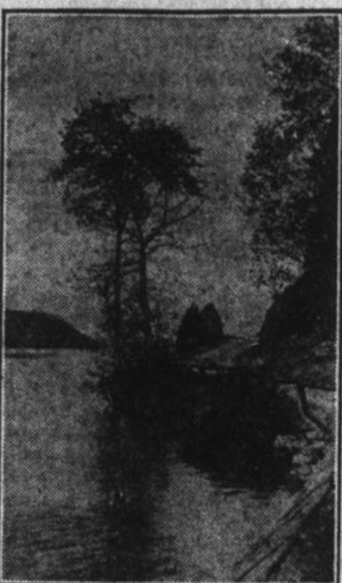
Wolf Lake, Bedford township.

During the last five or six years, owing to the Good Roads System, the Frontenac lake region lying north of Kingston has been opened to motorists and sportsmen and the farmers living in the district have reaped a rich harvest.