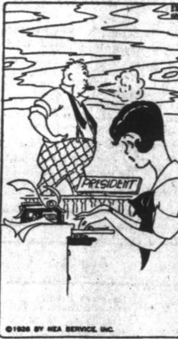
The man at the top may be up a tree.